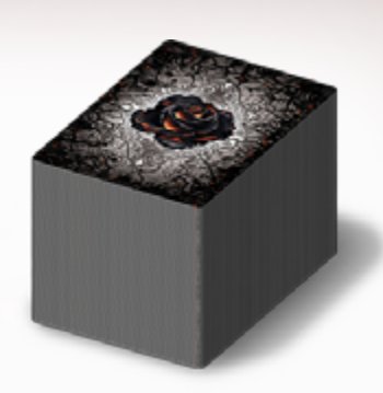
250 standard sleeves RRP 12€