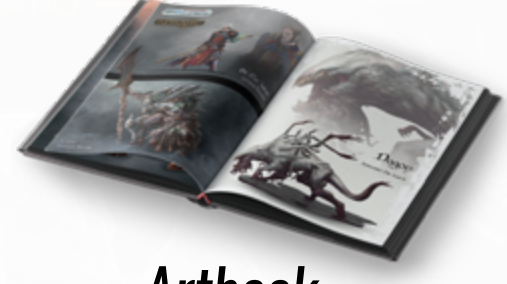
Artbook RRP 25€