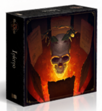
Inferno RRP 59€