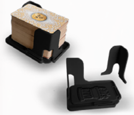
2 Card Holders RRP 6€