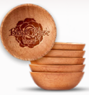
6 Bowls rrp 20€